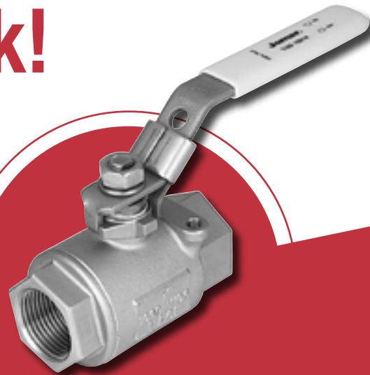
T-SS-1001N-VB Stainless Steel - 1000PSI - Full Port